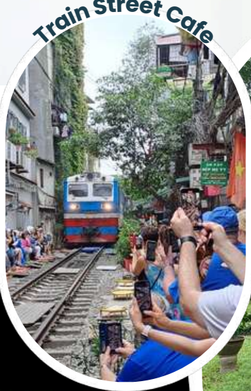
Train Street Cafe